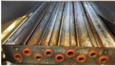
HEAT EXCHANGER W/NEW GASKETS