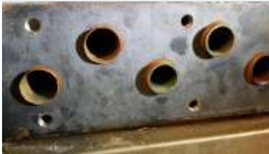
HEAT EXCHANGER END PLATE